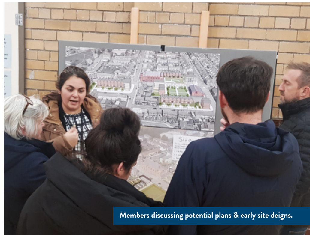
Members discussing potential plans & early site designs.