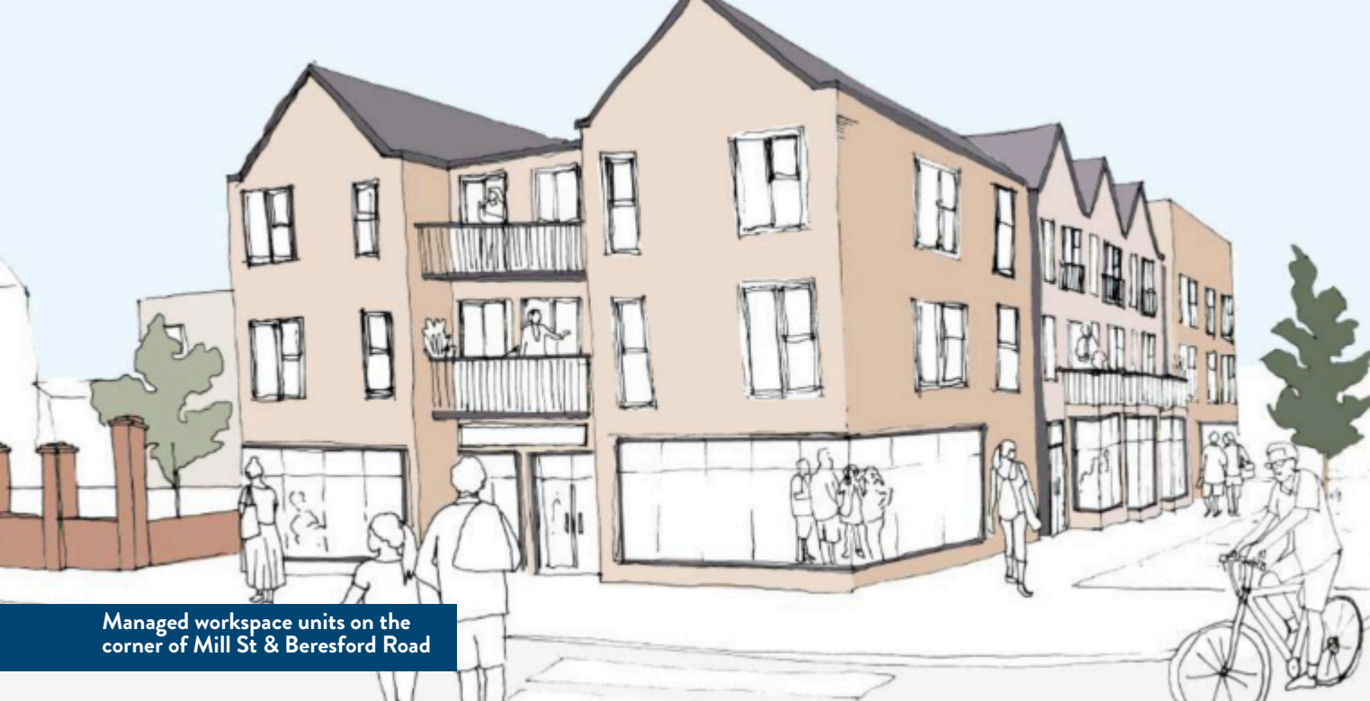
Managed workspace units on the corner of Mill St & Beresford Road