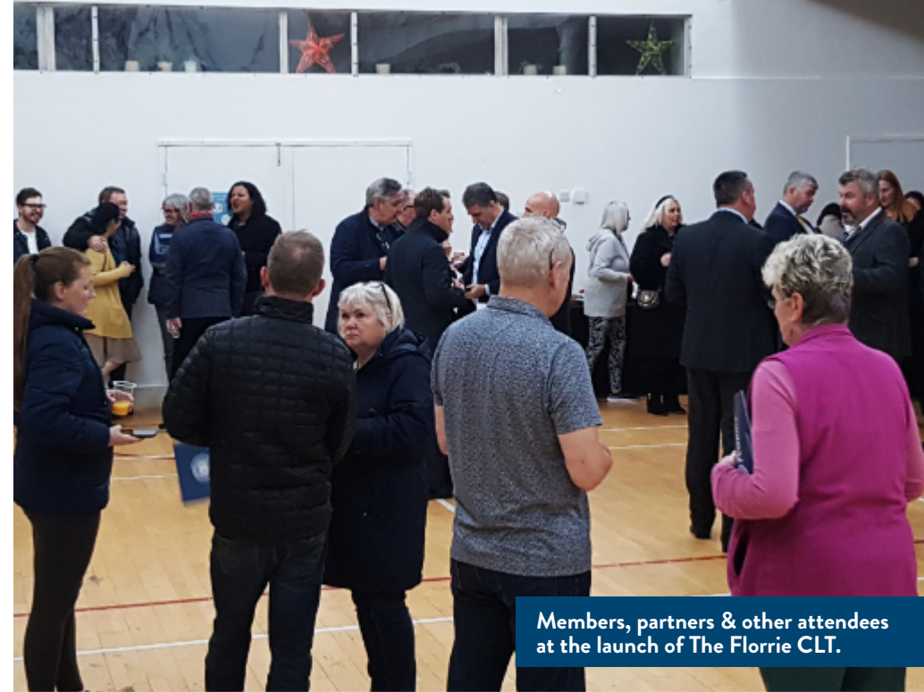
Members, partners & other attendees at the launch of The Florrie CLT.