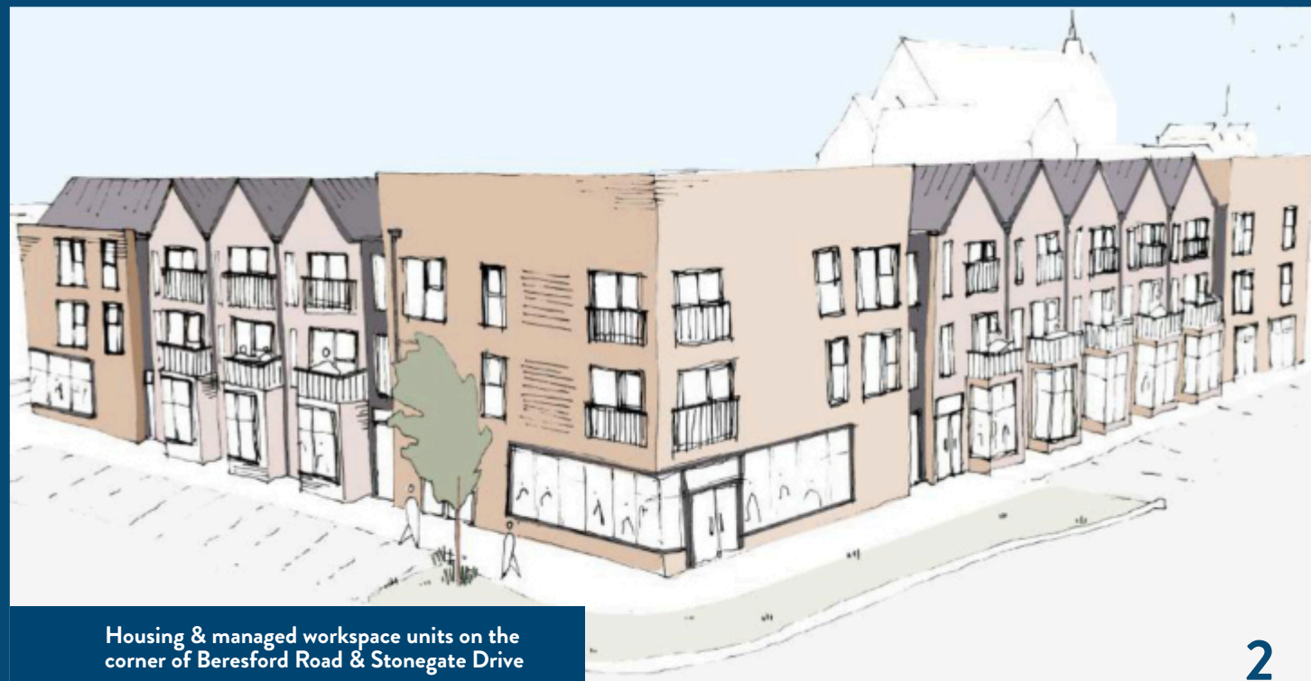
Housing & managed workspace units on the corner of Beresford Road & Stonegate Drive